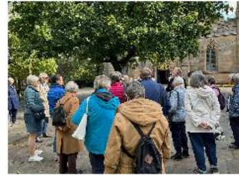
Blackburn Cathedral was another popular stop-off