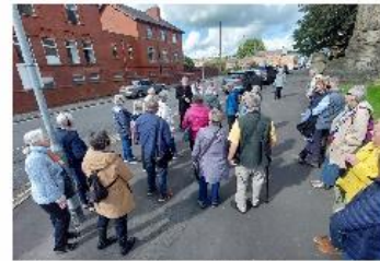
The tour was made up of Ikey and District USA group members