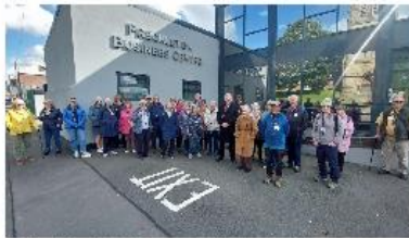
The tourists outside the Lancashire Telegraph's office

The Jubilee Street Telephone Exchange stands on the site of the original Amphitheatre. It could seat an audience of