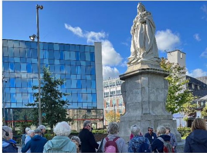
The tour take in Queen's Victoria's statue