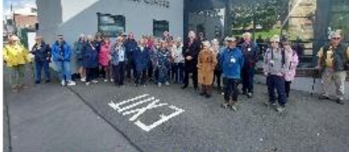
The tourists outside the Lancashire Telegraph's office

The Jubilee Street Telephone Exchange stands on the site of the original Amphitheatre. It could seat an audience of