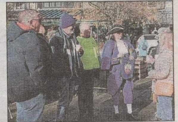
The u3a event on the Grove in Ilkley

The dedicated fitness hub that Ilkley Tennis Club and u3a set up recently is proving a valuable resource for opportunities for fitness, fun and friendship.